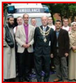
Ambulance Pull for charity