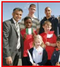
Enjoying Earlsfield & Sellincourt Olympics