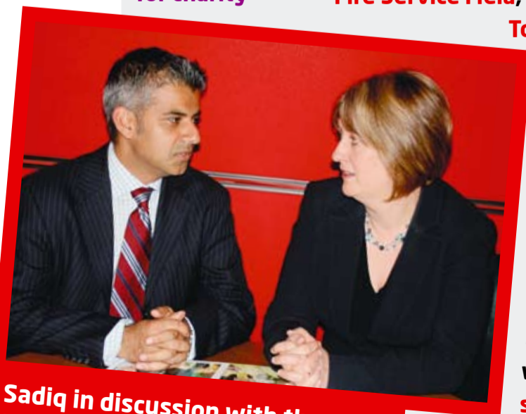
Sadiq in discussion with the Home Secretary Jacqui Smith

You can read more about Sadiq's activities on his website at www.sadiqkhan.org.uk