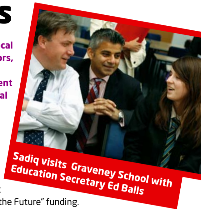
Sadiq visits Graveney School with Education Secretary Ed Balls

Sadiq Khan MP said "It's really good that all our excellent schools locally will benefit from the extra funding we have secured from the Government."